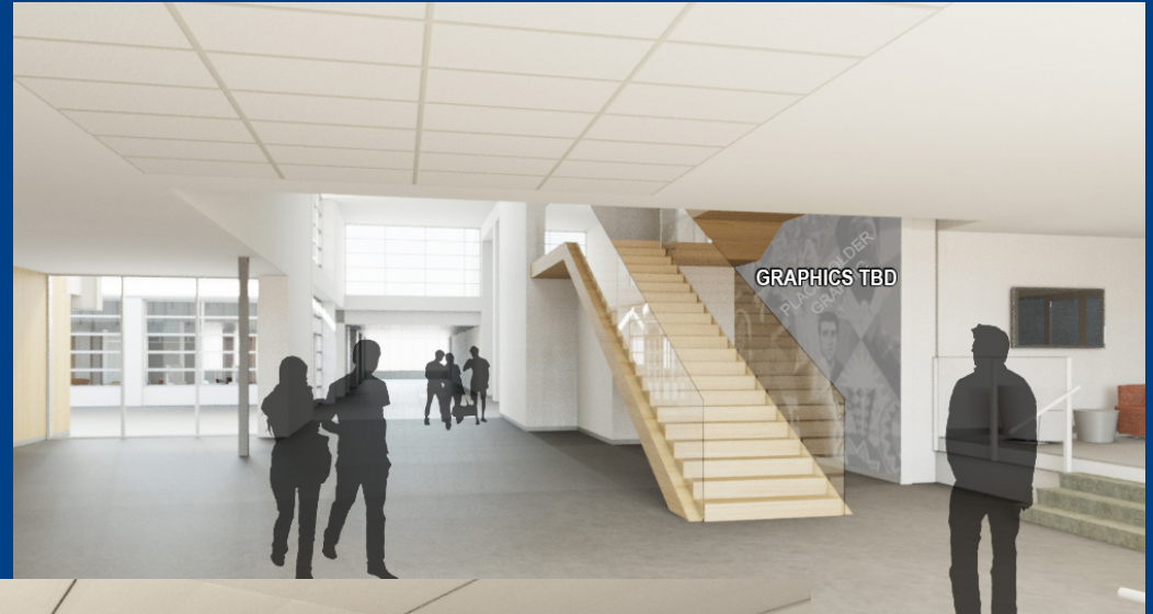
Level 6 (Street Level)